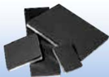
Set of plates