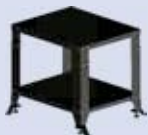
Table TAB-98 PRO

Strong support table for SEFA heat presses. Available with Castors.