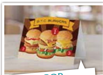
POP as advertisement