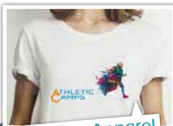
Custom Apparel (Heat transfer)